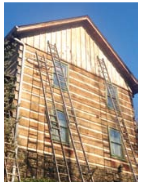
After cleaning with Cedar Wash