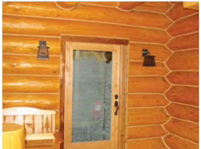
Perma-Chink and Energy Seal sealants applied around window frames, door frames, corners to keep the house weather tight.