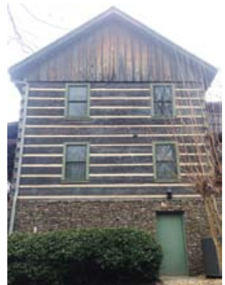
Before cleaning with Cedar Wash