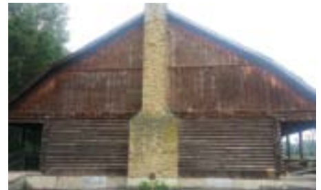
The work was donated by Legion members and took place on weekends