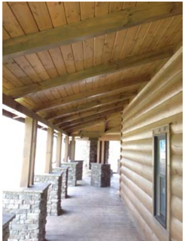
Lifeline Ultra-7 stain in color Smoke with Lifeline Advance Gloss cleat topcoat