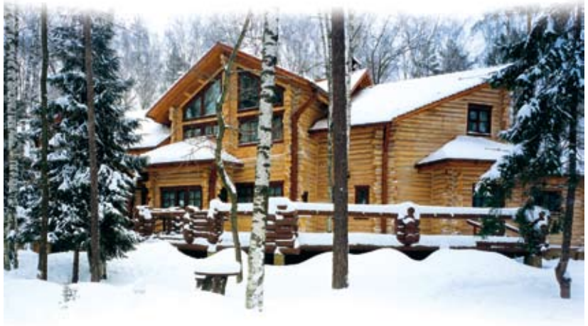
Beautiful Houses Press

Just adding a few comments to a newsletter is not nearly enough to sincerely express our gratitude to all our valued customers. It is your business with us that makes it possible to keep the lights on, invest in the research and development for new products, answer the phone, provide for the families of all Perma-Chink Systems employees and still have enough left over to pay the rent. It is your confidence in us and your patronage that keeps us successful.