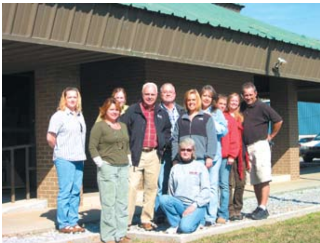
New Sales Office and Staff from Knoxville, TN